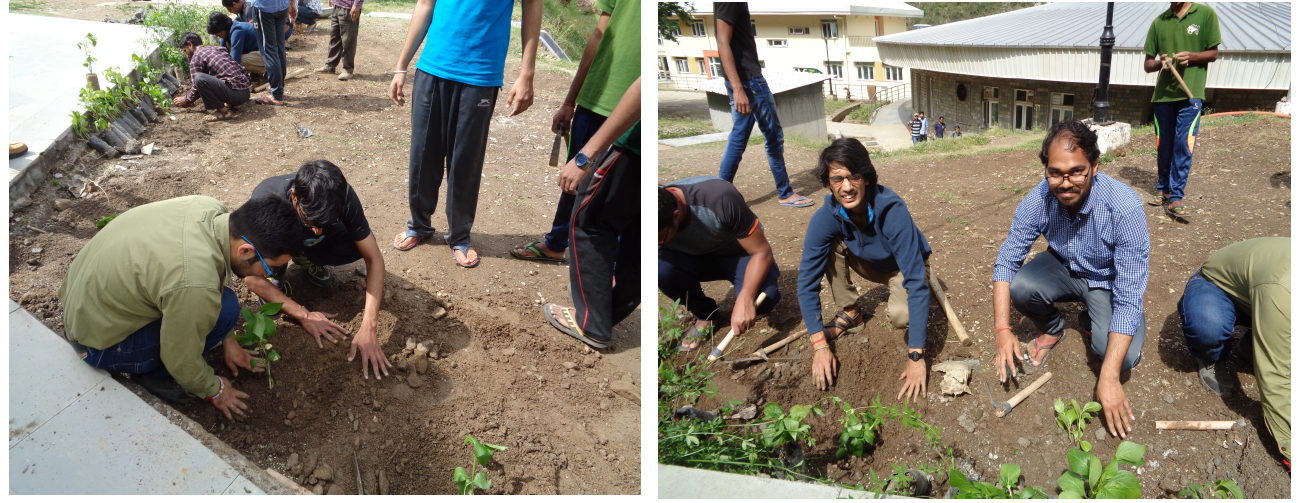
Plantation Drive –inbetween hostel buildings.

Preparation of bed of soil and plantation of saplings.