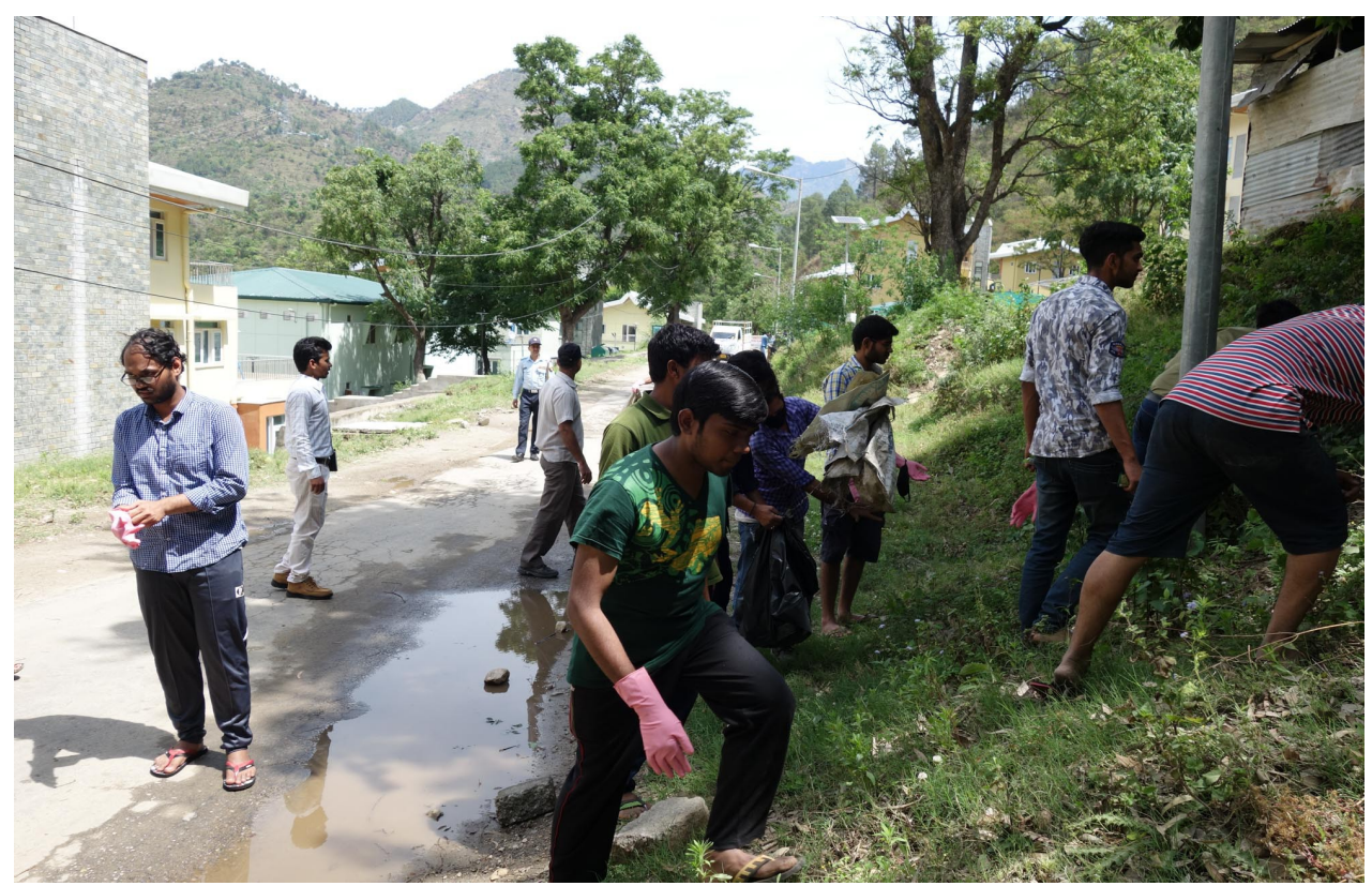
Picking- up of wastes from ground and disposing into three colour coded bins.

The activities of the group of enthusiastic and energetic students of the environmental club were supported by the presence of some faculty members and staffs of the institute. All the events of the morning session were accomplished successfully followed by healthy refreshments.