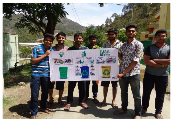
Spreading Awareness by Cleanliness Drive.