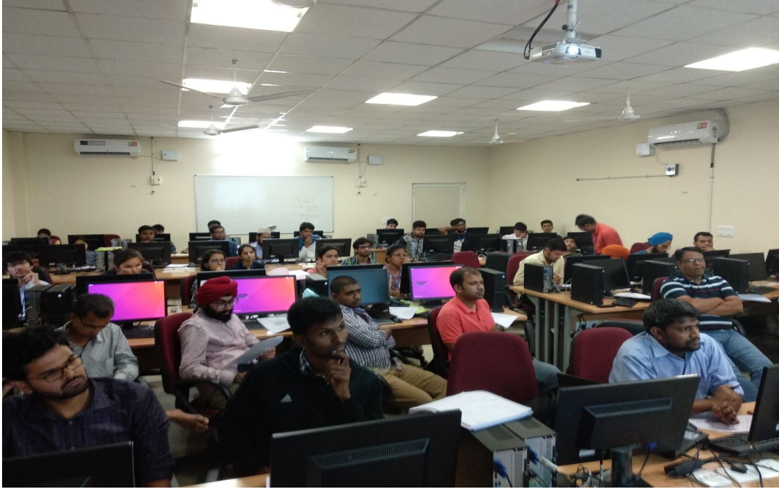
Participants paying attention during hands-on session