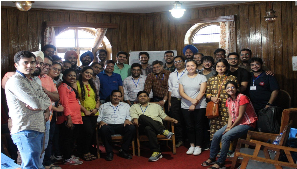
A lecture delivered on VAE at forest guest house, Prashar lake