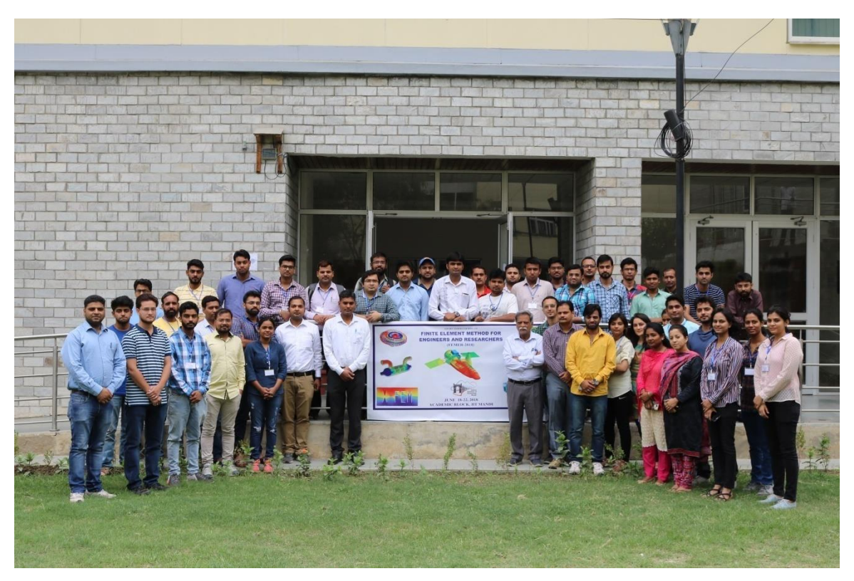
Picture 1: Group photograph of the participants and organizers at IIT Mandi, Kamand Campus