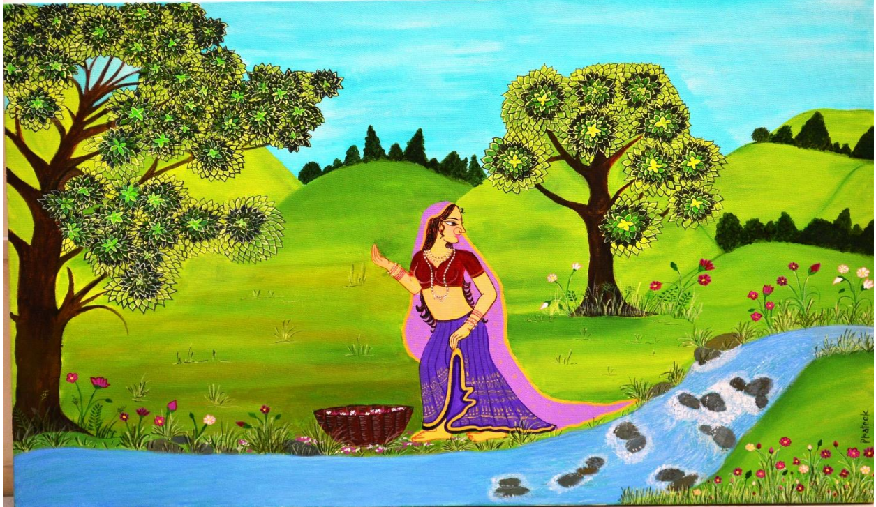
Spend few moments in nature to find yourself - Prateek Pathania