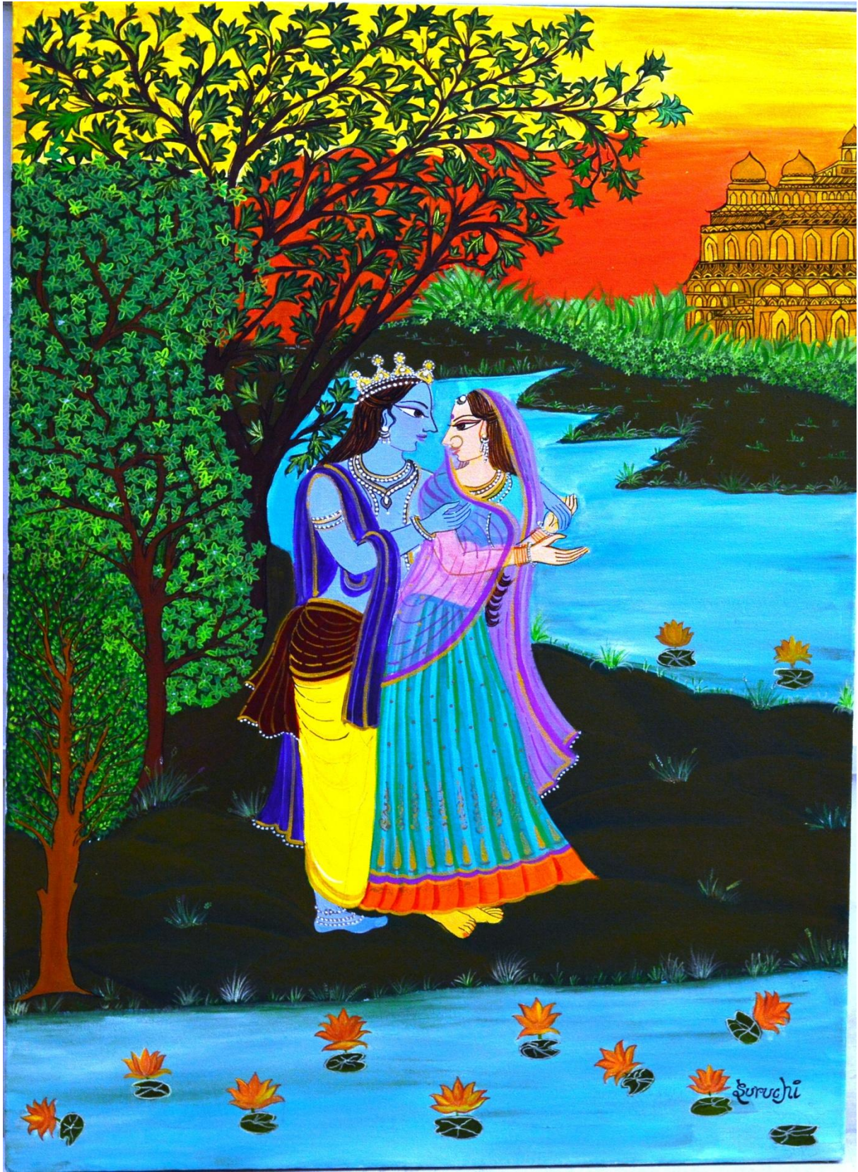
Dream your world and paint your dream - Suruchi