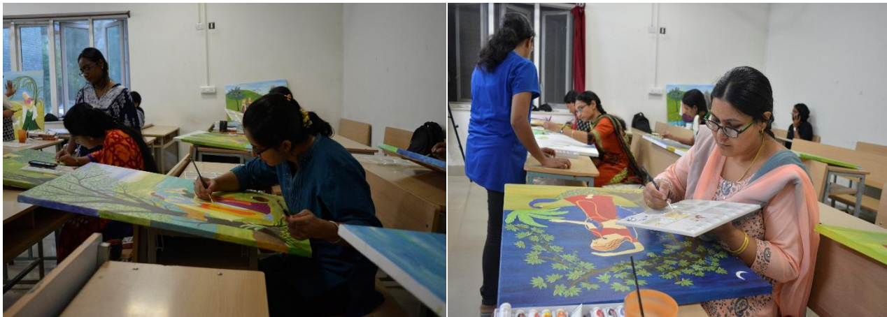
Participants are engrossed in applying colors on their imaginations