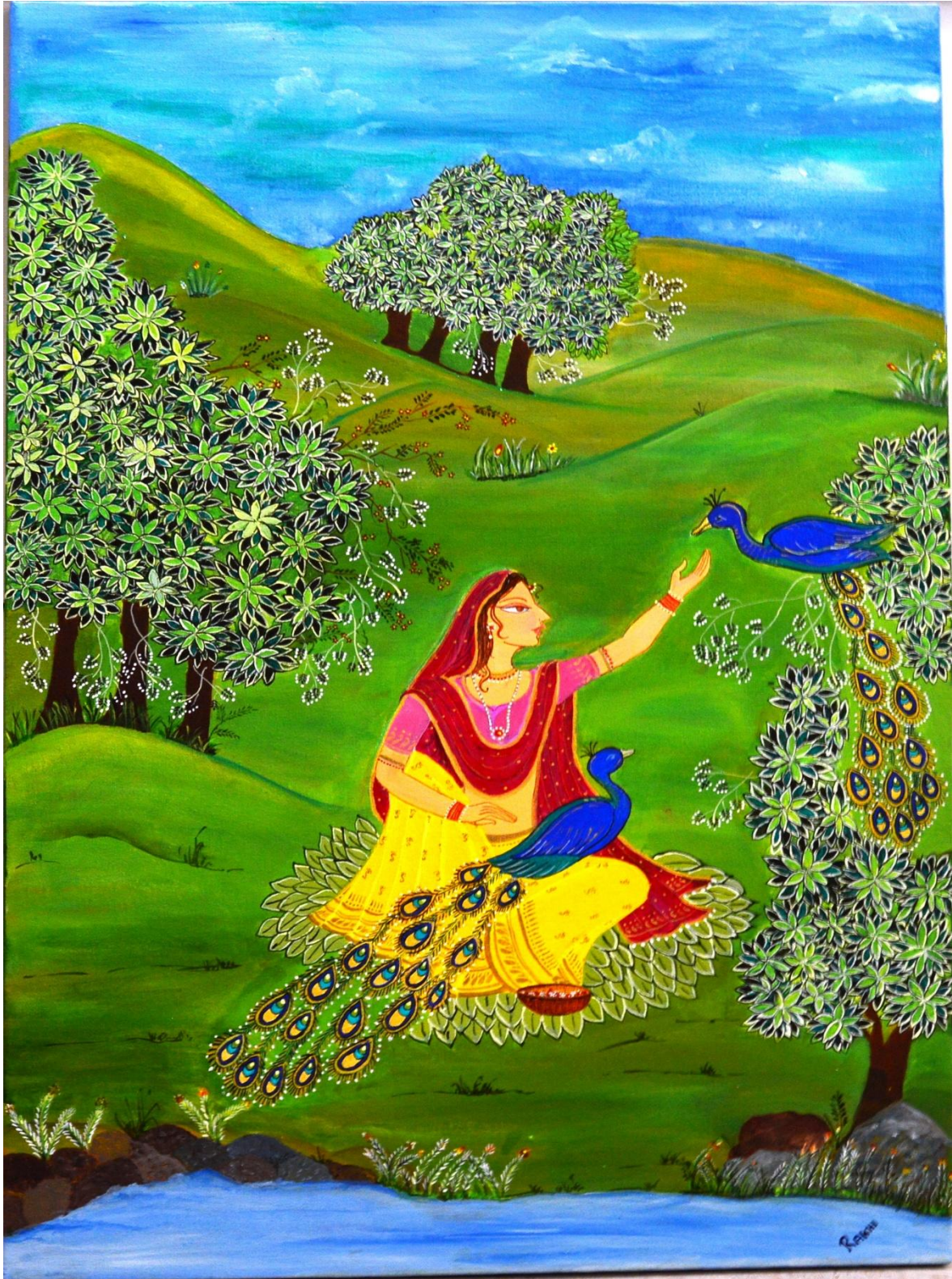
If you want to be happy, be in nature - Rakhi Bulti