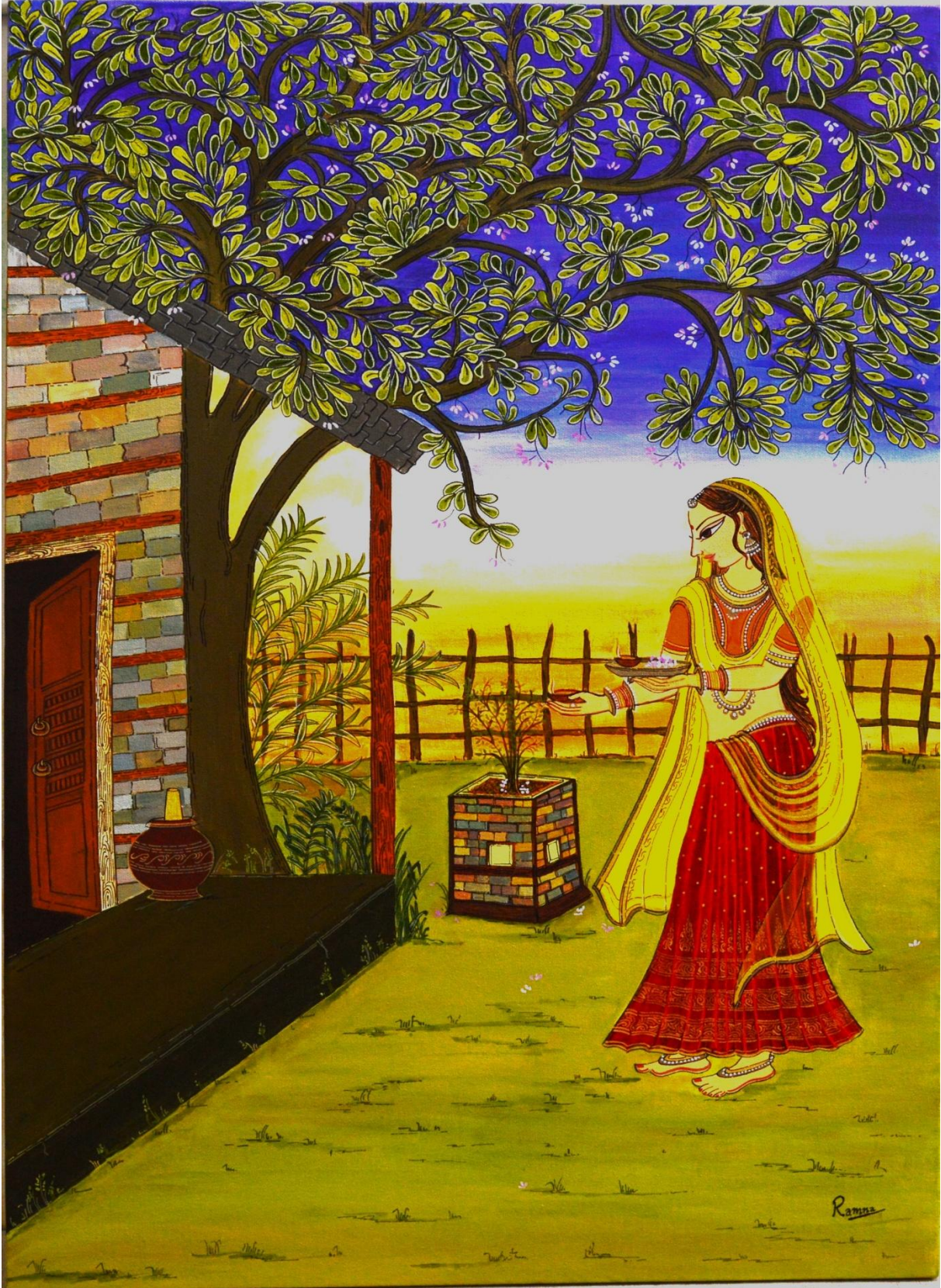
Don't always wait for sun to give you light, take your little lamp and make the difference - Ramna