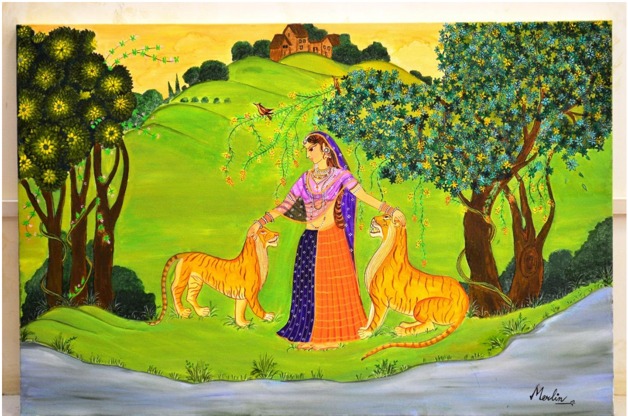
Try to love, if not, at least don't hurt - Merlin