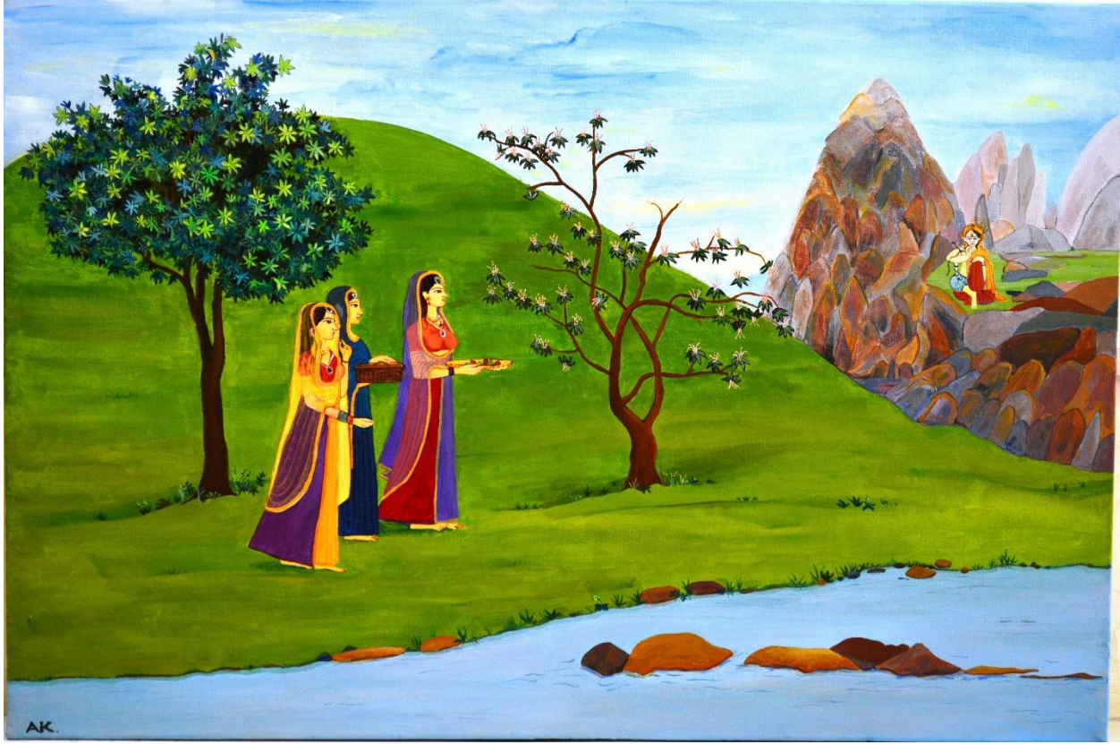
Small procession - Astrid Kiehn