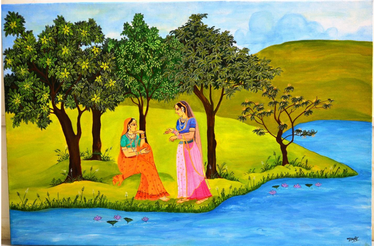
An afternoon in the garden - Shyamasree