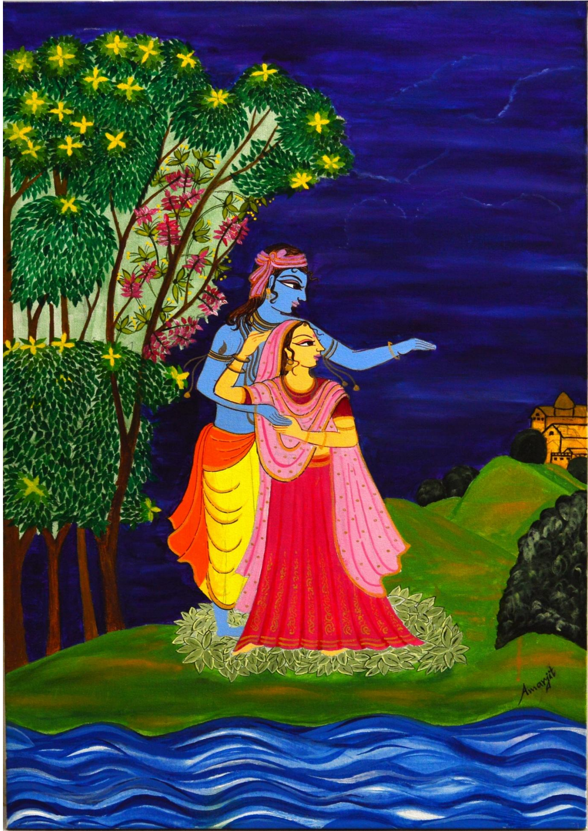
Unconditional love - Amarjeet