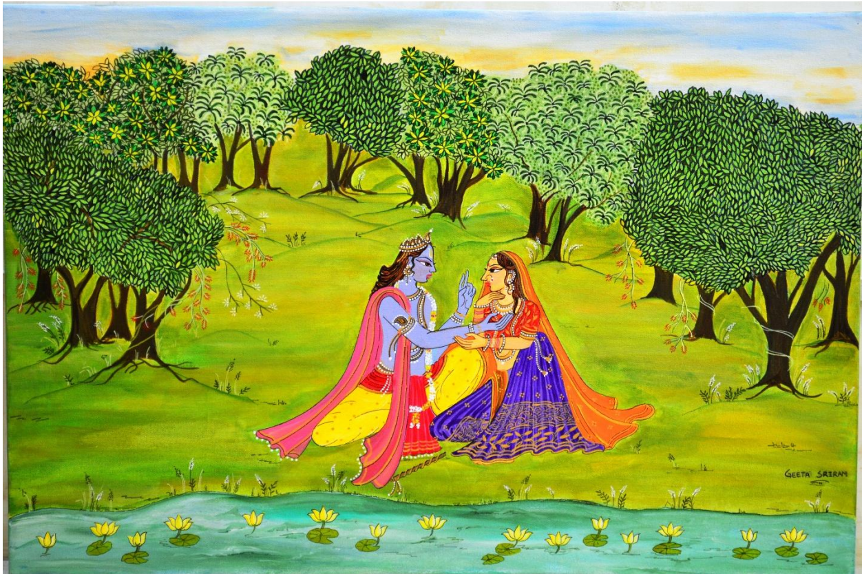
Sharing eternal moments - Geeta Sriram