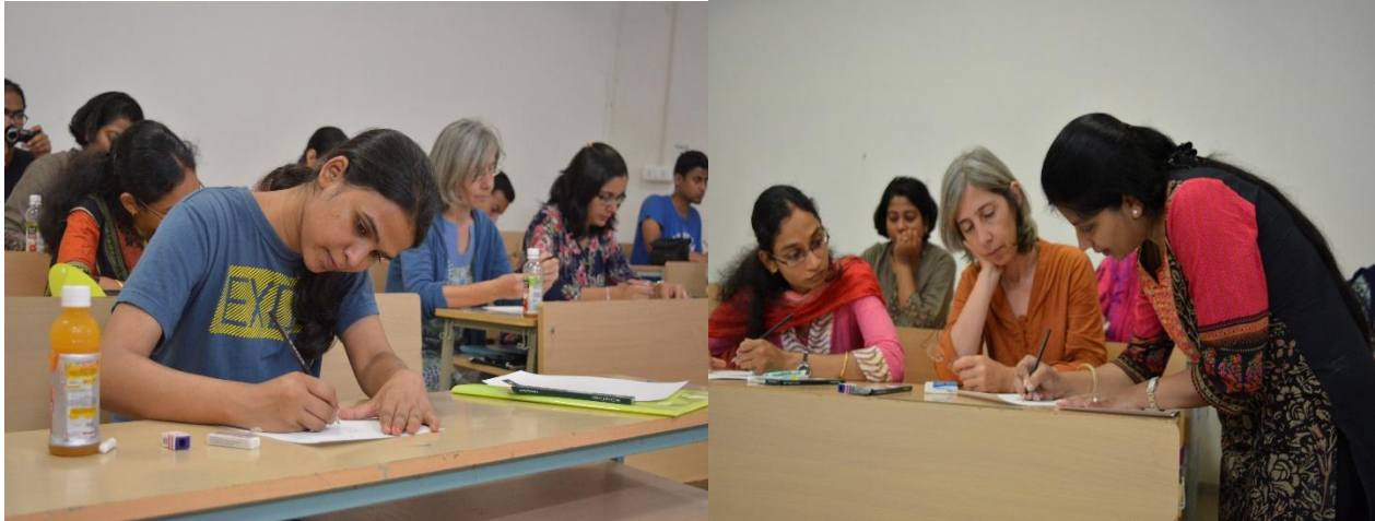
Participants are learning the art of pahari painting